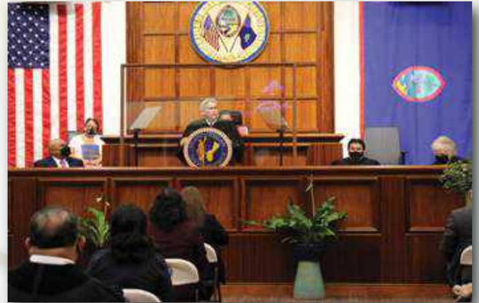
2021 State of the Judiciary Address