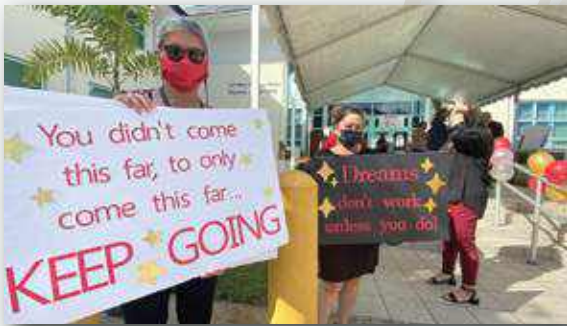
Judiciary employees hold up signs of encouragement during an Adult Drug Court graduation ceremony held on Nov. 19, 2021.

Each committee, chaired by a Judicial Officer and comprised of court managers, employees, and stakeholders, has identified goals and objectives and developed projects aligned to each strategic focus area.