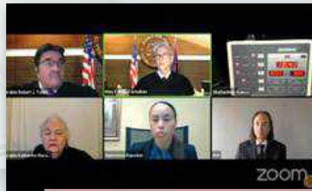
(Left) Supreme Court Virtual Hearing; (Right) The new multi-purpose courtroom.