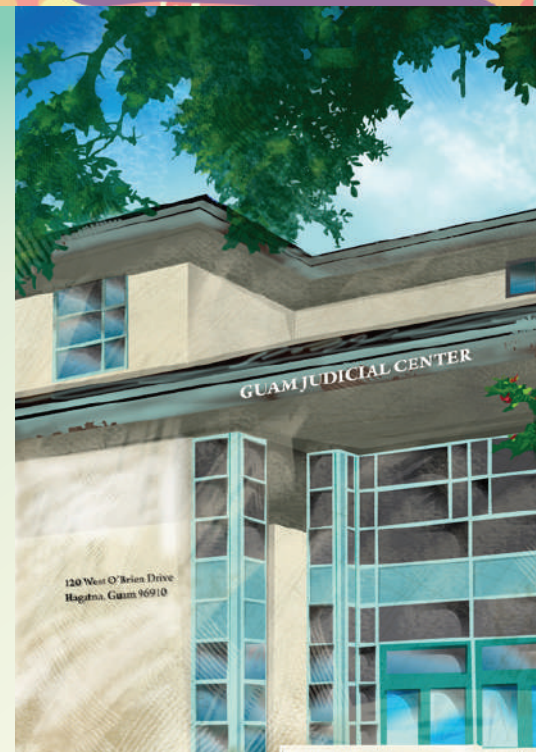
120 West O'Brien Drive Hagatna, Guam 96910